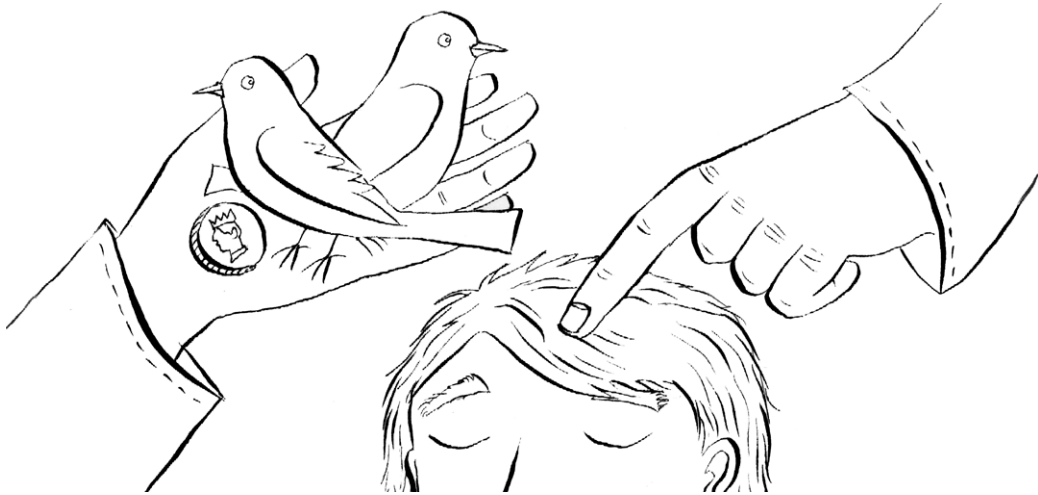
Even the hairs on your head are counted.

Jesus reminds us that we need to stand up and speak out for our faith, even when it is costly to us.