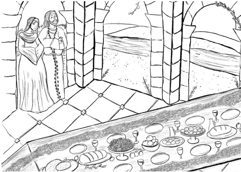
'Bring in everyone you can find.'

Jesus tells a story of an invitation that no one responds to, which is then opened to others who do come, but one guest doesn't dress appropriately for the wedding feast.