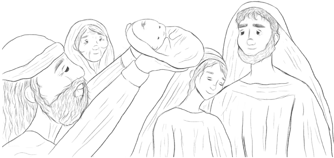
Simeon meets the baby Jesus and knows that he is the promised Messiah.

Simeon knew Jesus was very special. Solve the puzzle to find out how he described Jesus.