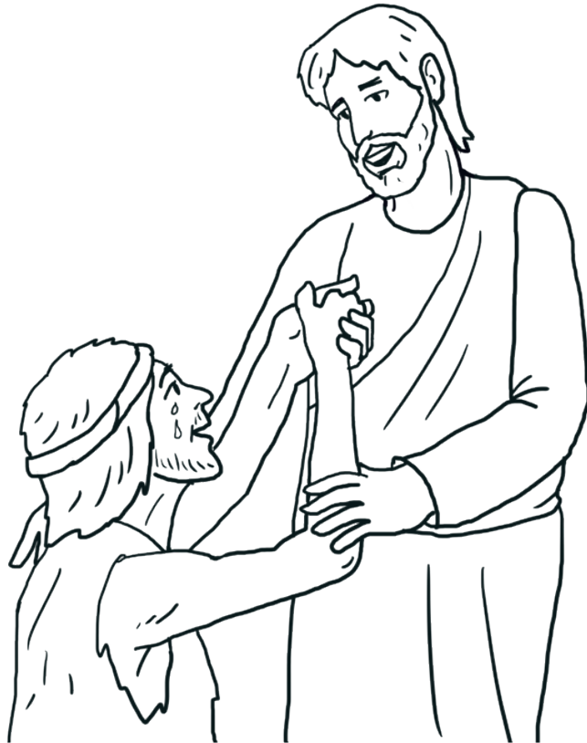
Only one of the ten men whom Jesus healed remembered to say thank you.

After Jesus heals people, the person who seems the least important remembers what really matters.