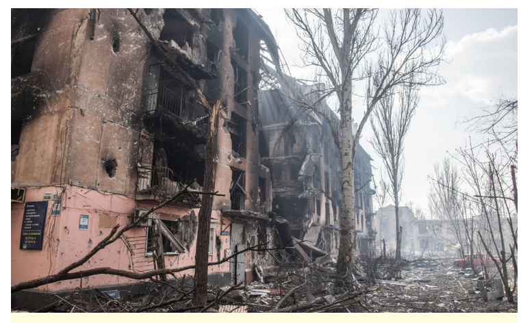
How do you keep going when things get tough? What words might God give us to help people in challenging times?

When everything in life is overwhelming, we often turn to music. When you are sad, do you listen to sad music to suit your mood? Or a cheerful tune to change it? Music triggers a response in the brain that brings pleasure. It provides an escape from too much reality, often by triggering memories of previous experiences. Listen to some music that suits your mood today. Then try different music to see how it changes your mood. Give thanks for the gift of music.