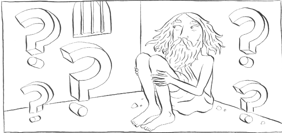
John has a big question to ask.

John doubts who Jesus is, but Jesus sends a message sharing the good things he is doing.