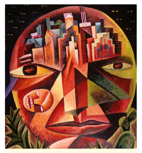
What temptations can you see in this painting?

With your family or friends, find some Bible verses that might be helpful in times of testing – e.g. Psalm 141.3; James 4.7-8; Hebrews 2.18 (use an internet search to help you find others). Write the verses out, fold them up, put them in a hat. Draw one each at random. Try to think of creative ways to help each other learn the verse – e.g. with a mime or dance moves, or a cartoon drawing. Play this more than once to see how many verses you can learn in a week.